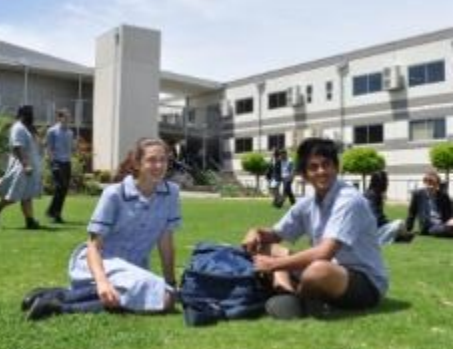
Middle School students relax on the College Green

Many people in the Diocese were strong supporters of the school in its early days. They will be pleased to know that their faith was not misplaced and that the school continues to prosper into its third decade.