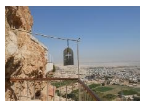
Looking over Jericho from the Monastery of The Temptation

truly an oasis in the desert. Its history stretches back for at least 10,000 years and it is still a vibrant lush place. Here, in extreme heat, we ascended the Mount of Temptation by cable car and many steps, to the Greek Orthodox monastery at the top which marks the site of Jesus' temptation by Satan, and his fast of 40 days and 40 nights. We had a beautiful Palestinian meal of chicken and rice cooked in one pot maqluba - and many glasses of refreshing pomegranate juice.