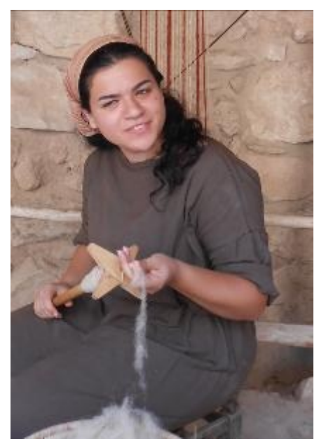
"Mary" in Nazareth Village

Our first day comprised trips to Mount Tabor, the site of the Transfiguration, and Nazareth, for the Basilica of the Annunciation, where we celebrated Mass; St Joseph's Church and a recreation of a Nazareth village, where everything is done as it was in the first century. We enjoyed a typical meal of the time, which was simple and delicious.