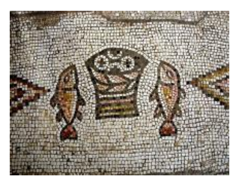
The mosaic at Tabgha

In holy places where we did not celebrate Mass, we would have a reading from the Scriptures, pray and sing a hymn appropriate to the location. At Sower's Bay we remembered the parable of the Sower and at Tabgha the Miracle of the loaves and fishes; a permanent reminder is in the mosaic floor in front of the altar in the Church there.