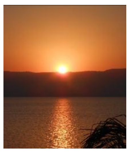
Sunrise over the Sea of Galilee