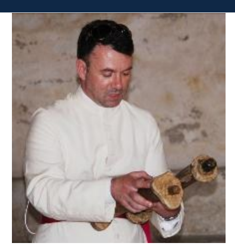
Improvising with an iPhone and a scroll.

We returned to Tiberias via Cana, where the Miracle of the water into wine took place, passing the obligatory wine tasting shop on our way to the