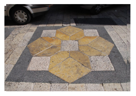
My first and last patch working/ quilting exercise in silk brocade.